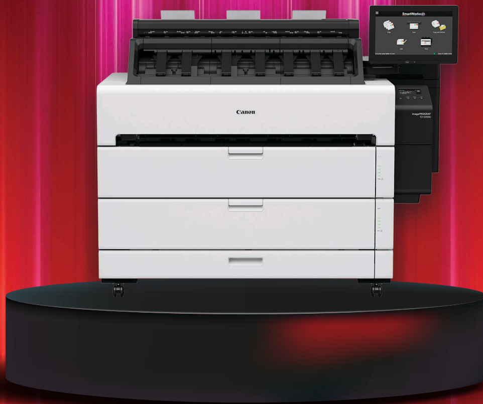
imagePROGRAF TZ-32000 MFP Z36