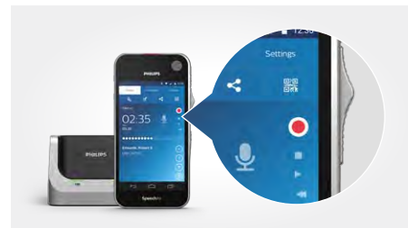
SpeechAir Smart Voice Recorder