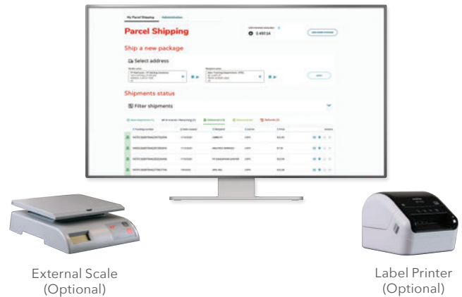
External Scale (Optional)