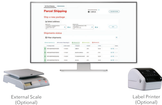
External Scale (Optional)