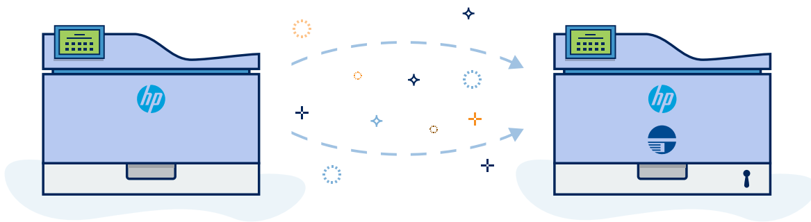
Standard HP LaserJet Printer

The printer's outgoing network connections are inspected to stop suspicious requests and thwart malware.