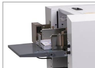
Side Air Blower