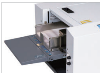
Air Suction Feed System