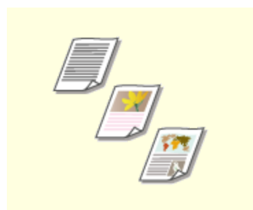
▶ Selecting the Type of Original for Copying

You can improve the copy quality by specifying more detailed settings, such as selecting the optimum image quality, erasing unnecessary shadows, etc.