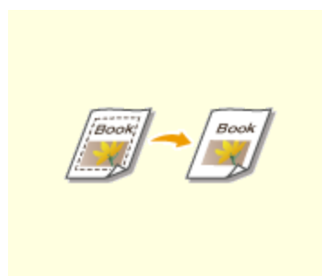
▶ Erasing Dark Borders When Copying (Erase Frame)