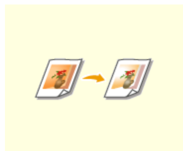
▶ Adjusting the Color