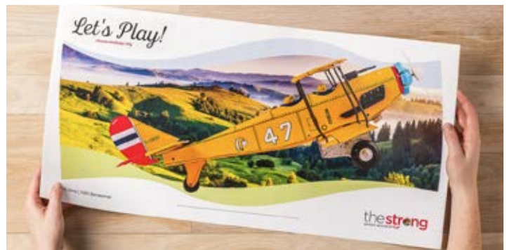
Extra-long sheet printing—maximum paper size 13 x 26" (330 x 660 mm)

It all adds up to better margins, higher profits and the ability to grow strategically with a single, future-proof investment.