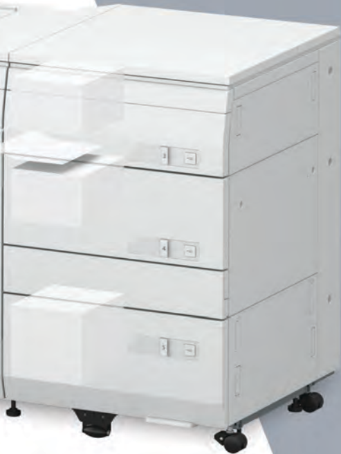
imagePRESS V1000 shown with optional accessories.