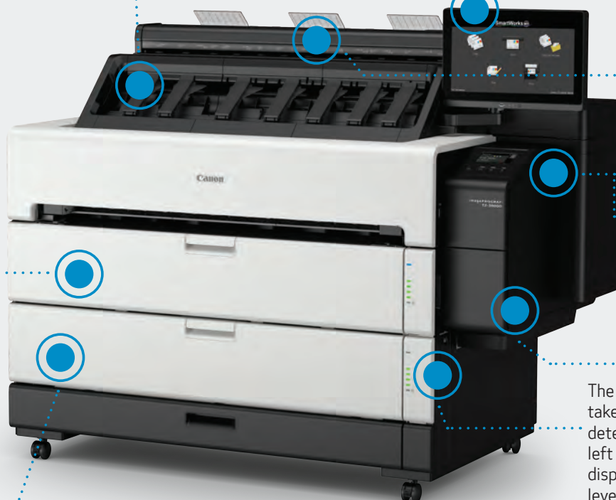
TZ-30000 MFP Z36 model shown.

The imagePROGRAF TZ ships standard with a Dual Roll for maximum productivity. Load up to two (2) rolls of 36" paper or mix-and-match paper types and sizes.