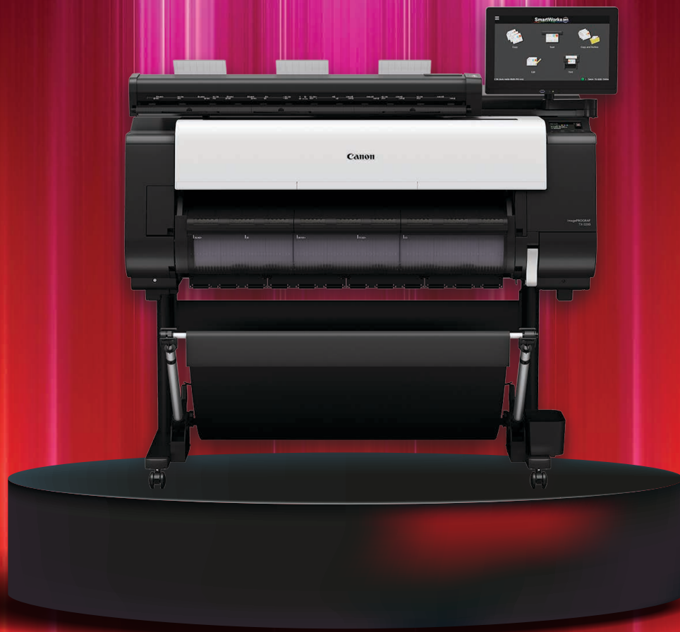
imagePROGRAF TX-3200 MFP Z36