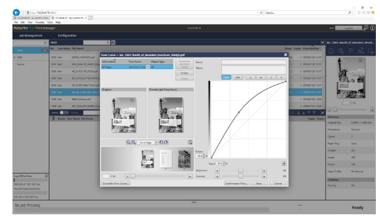
TONE CURVE UTILITY