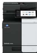
bizhub i-Series C4050i

To learn more, please visit workplacehub.konicaminolta.com