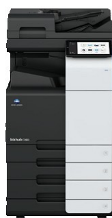
bizhub i-Series C360i