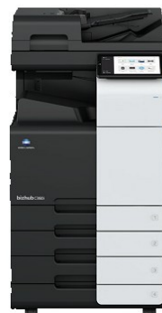
bizhub i-Series C360i